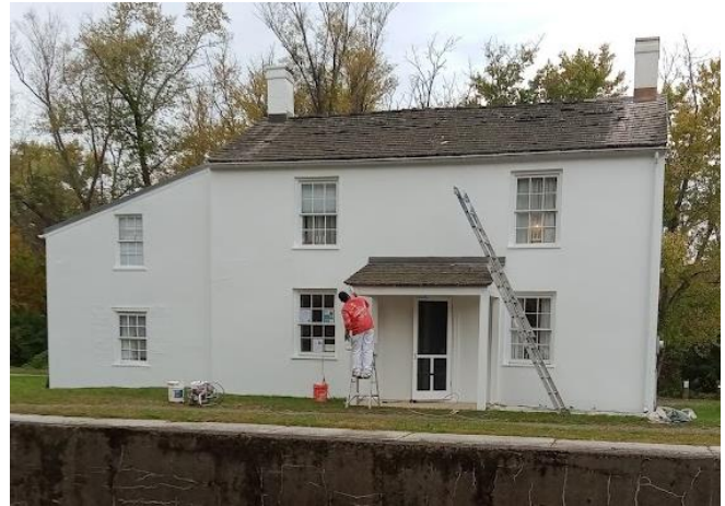
PAINTING THE LOCK-TENDER’S HOUSE

We will be keeping the House open from on weekends and major holidays through November from 10 am to 4 pm. We continue to have visitors from near and far including a number from abroad.