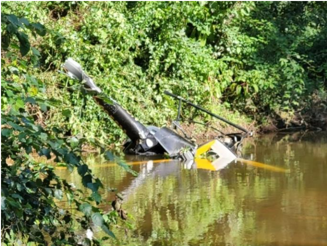
Helicopter in Heathcote Brook

A small helicopter, apparently experiencing mechanical problems, crashed in Heathcote Brook between the D&R canal and the Millstone River just 200 yards upstream of the Lock-tender’s House.