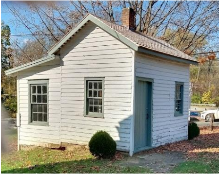
TOLL HOUSE with new door and roof

The Toll House has needed work for some time. KHS is continuing to work with the Park Service and the Canal Society, which again generously provided the funding to replace the existing door and roof. That work is now completed.