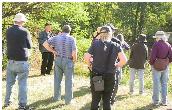
KHS Walk along the canal, 2024

"I was thrilled to learn why Kingston has been, and always will be, the crossroads of New Jersey."