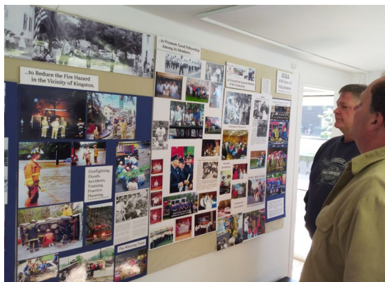
Display at Locktender's House

"I was excited to join the archivist team when I found out that Kingston has such a fascinating, and little-known, history."