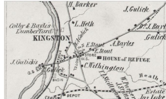
Library of Congress Middlesex County 1850 (detail)

KHS Archivist Team... Join us as we Explore a 300-year- old village Right in your own back yard