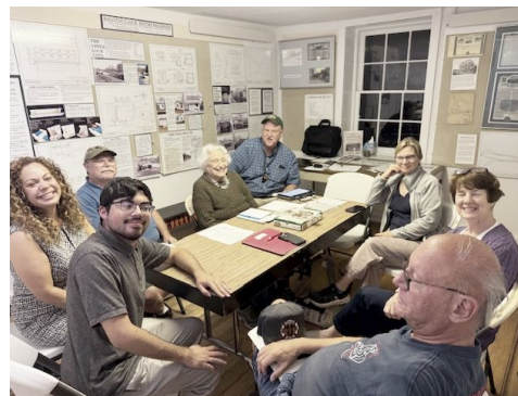
Archivists at the Locktender's House

"I was excited to join the archivist team when I found out that Kingston has such a fascinating, and little-known, history."