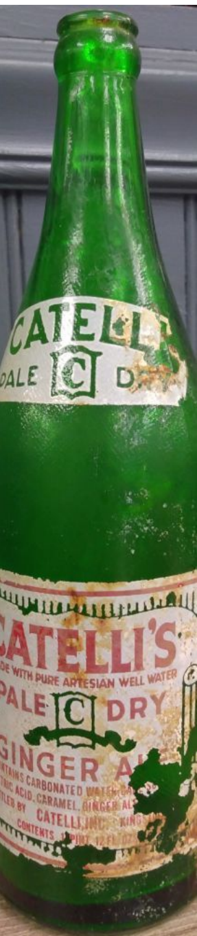
Bottled in Kingston